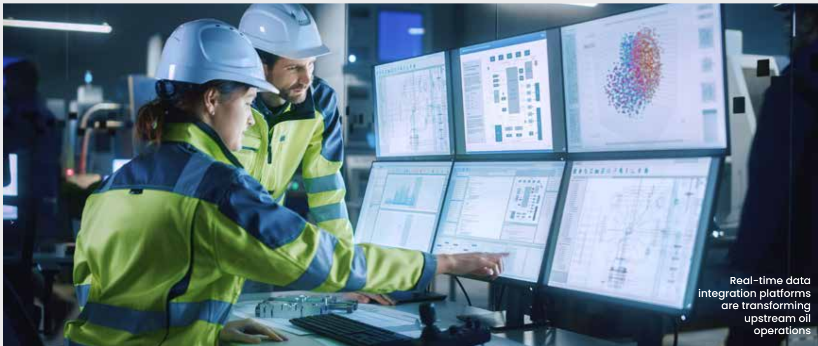
Real-time data integration platforms are transforming upstream oil operations

Upstream oil firms face fragmented legacy systems, growing data complexity and cybersecurity risks; and despite soaring investment in AI, digital twins and IoT, operators struggle with interoperability, skills shortages and real time connectivity in remote oilfields