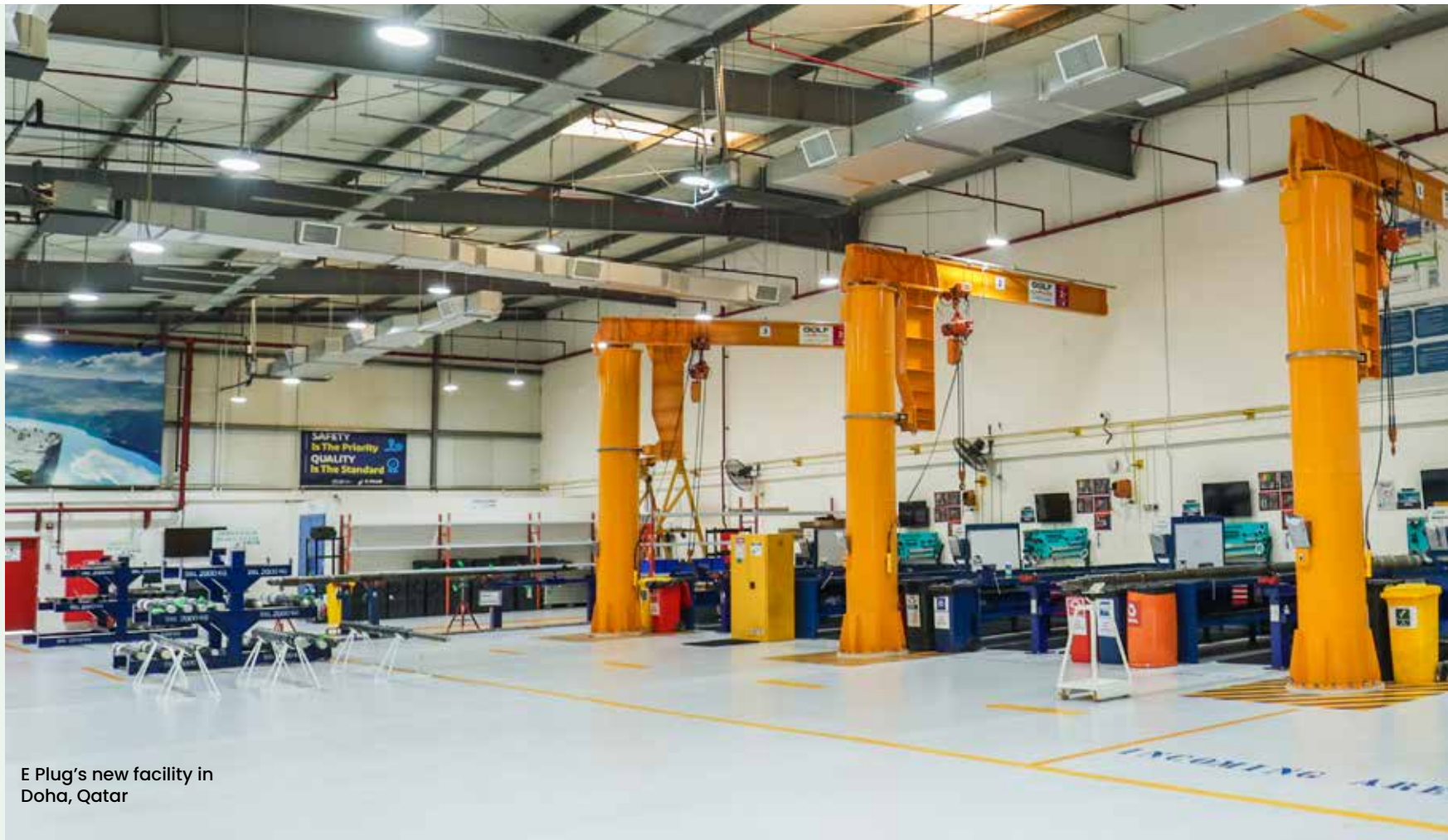
E Plug's new facility in Doha, Qatar