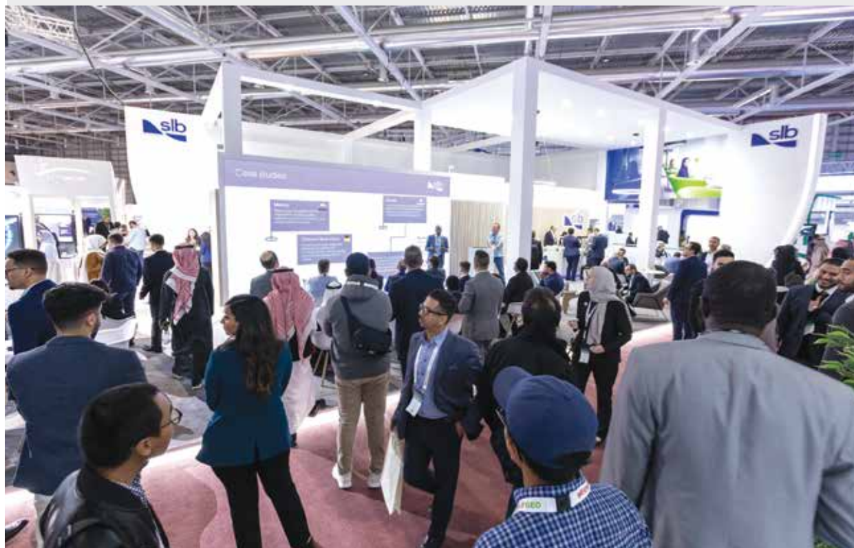
Over 17,000 people attended the 2023 edition

This year's theme, 'Energy for a Prosperous Future: Leading a Sustainable Tomorrow', builds on the evolving priorities of the industry, from hydrocarbon optimisation and digitalisation to decarbonisation and talent development