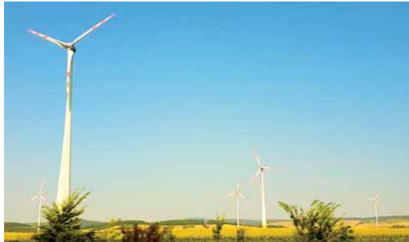
In 2024, renewables averted $467 billion in fossil fuel expenditures

Much of this progress is driven by a combination of technological inno-