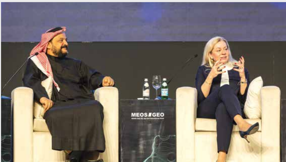
Global energy leaders will discuss issues in the Strategic Sessions

Global energy leaders from Bahrain, Saudi Arabia, and elsewhere will tackle key topics head-on. Panel sessions, such as the plenary, 'Navigating the Future of Energy: Investment, Innovation, and