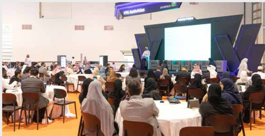
The Young Professionals and Students corner serves as a real-world classroom for students

In a post-pandemic, post-carbon, and digitally charged world, the value of coming together to exchange ideas, showcase progress, and chart a course forward has never been more crucial. ■